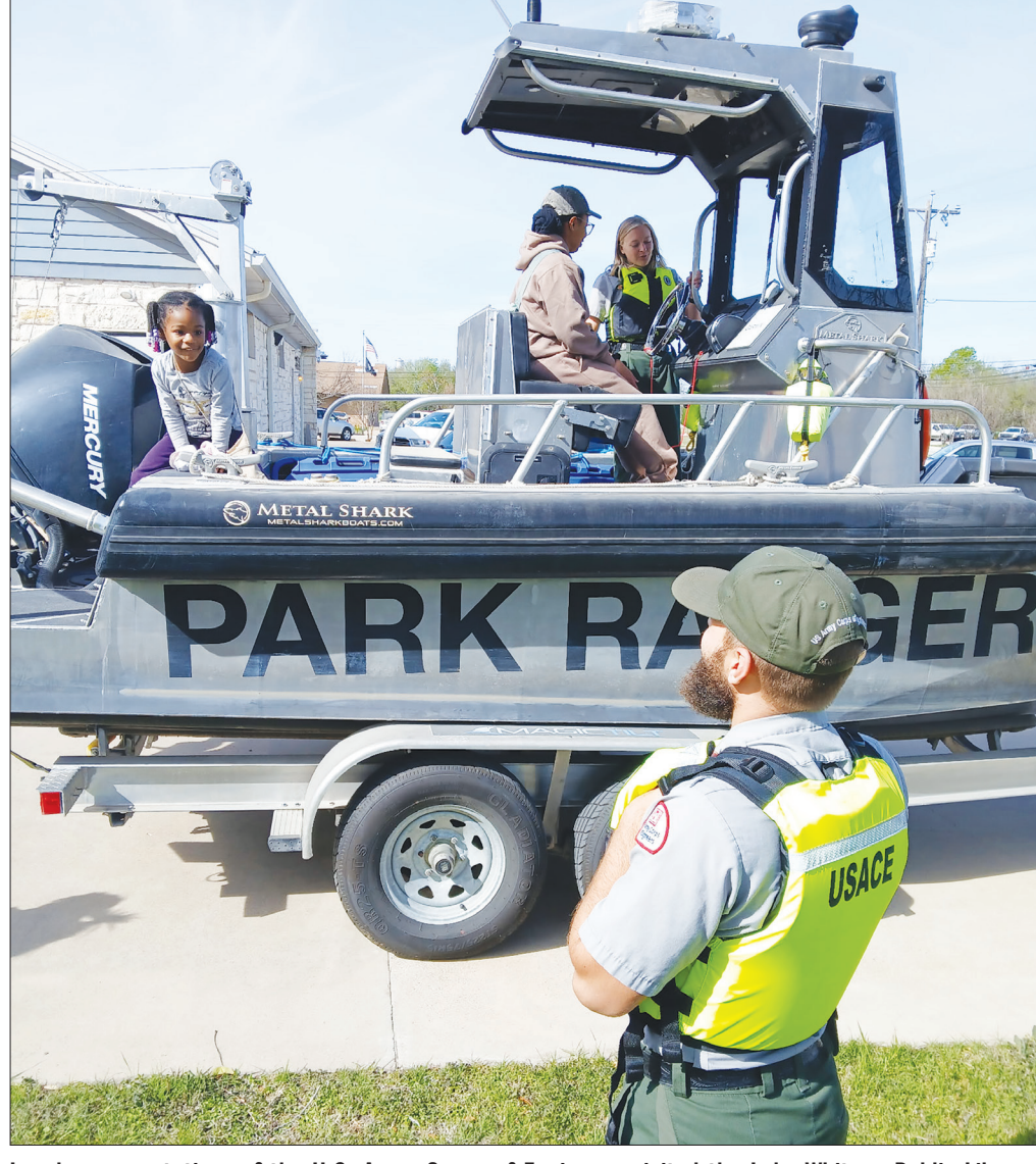
Local representatives of the U.S. Army Corps of Engineers visited the Lake Whitney Public Library Tuesday, March 17, sharing water safety tips, discussing the importance of life jackets and giving children an up-close look at a park ranger boat during a spring break program. The library also hosted a sewing class for homeschool students last week. Ongoing programs offer opportunities for fun, connection and education for all ages. For a full schedule, see the weekly column in The Lakelander or visit the library's website at www.whitneylibrary.org .